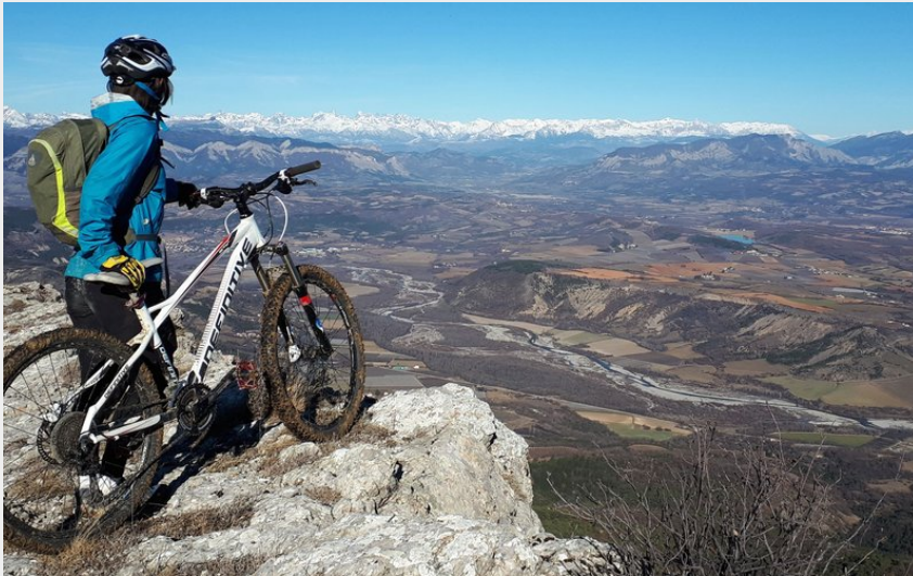
Panorama depuis la montagne de St-Cyr (CCSB)