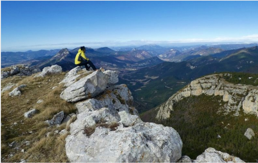
Sommet du Bonnet Rouge (CCSB)