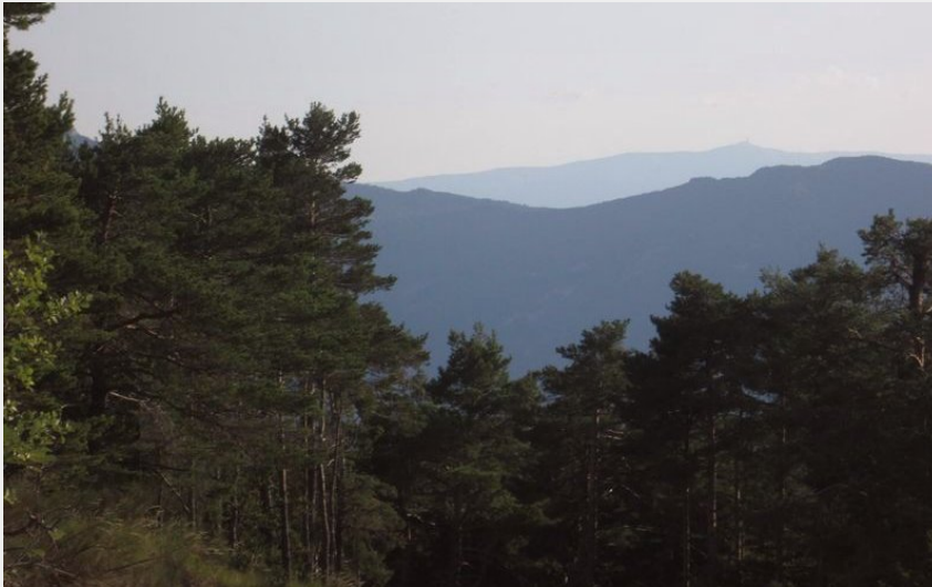
Panorama sur le Mont Ventoux au fond (CCSB)