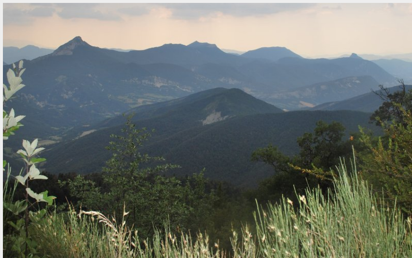
Jolie lueur sur les hauteurs du Duffre (CCSB)