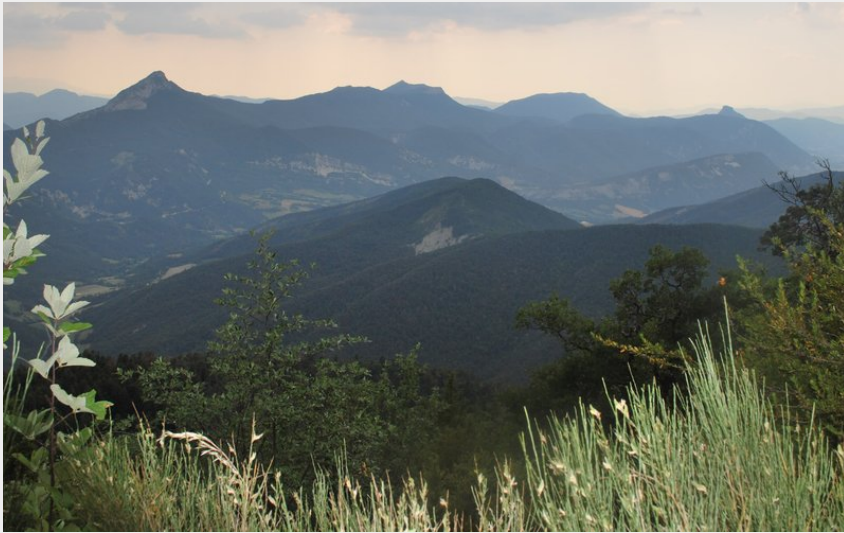
Jolie lueur sur les hauteurs du Duffre (CCSB)