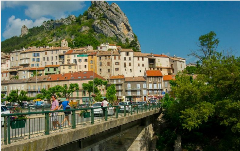
Vue sur le village de Serres (Espace Rando)