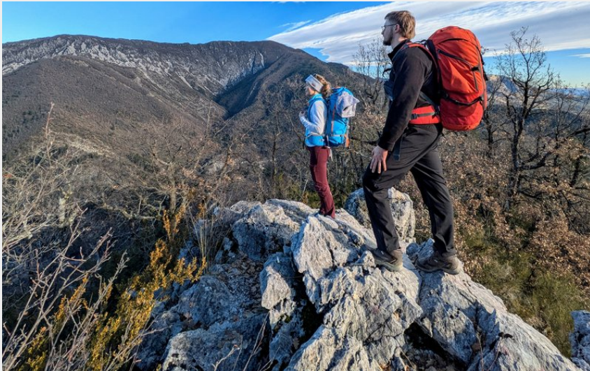
Panorama depuis la crête de Fontarache (CCSB)