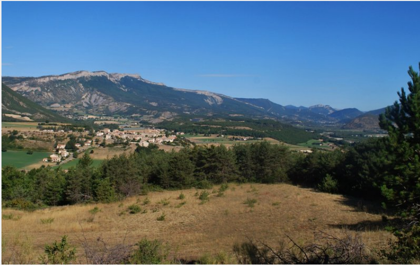
Panorama sur la Vallée du Buëch (CCSB)