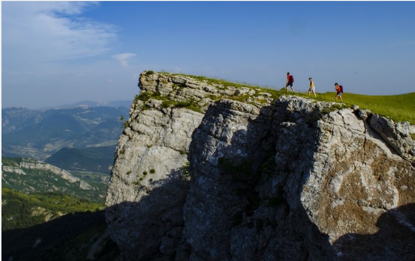
Magnifique portion sur crête (CCSB)