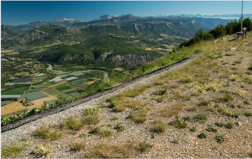
Les Espranons (CCSB)