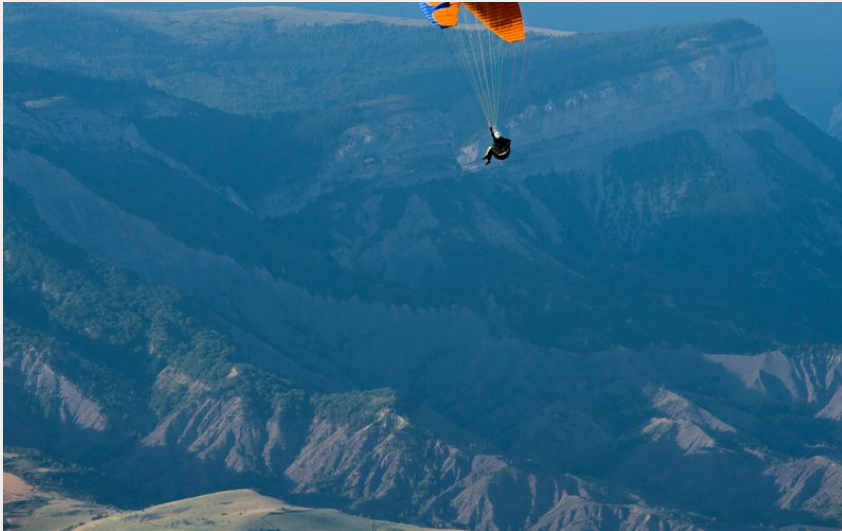
La crête de Chabre (CCSB)