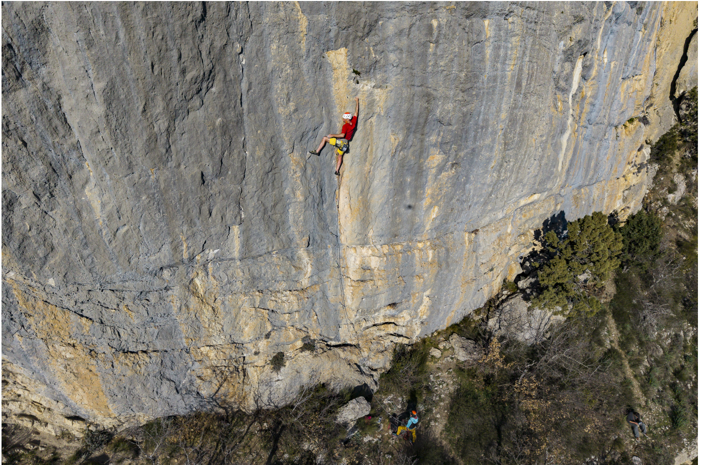
The Villard Cliff (Ventavon)

Facing south at an altitude of 1,000 meters, the Baume Rousse cliff is a winter climbing destination. The climbing here is very varied, with routes to suit all skill levels. The view of the Durance River offers a splendid panorama.