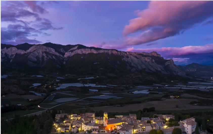
Soleil couchant sur le village de Ventavon et la falaise (Sam Bié)