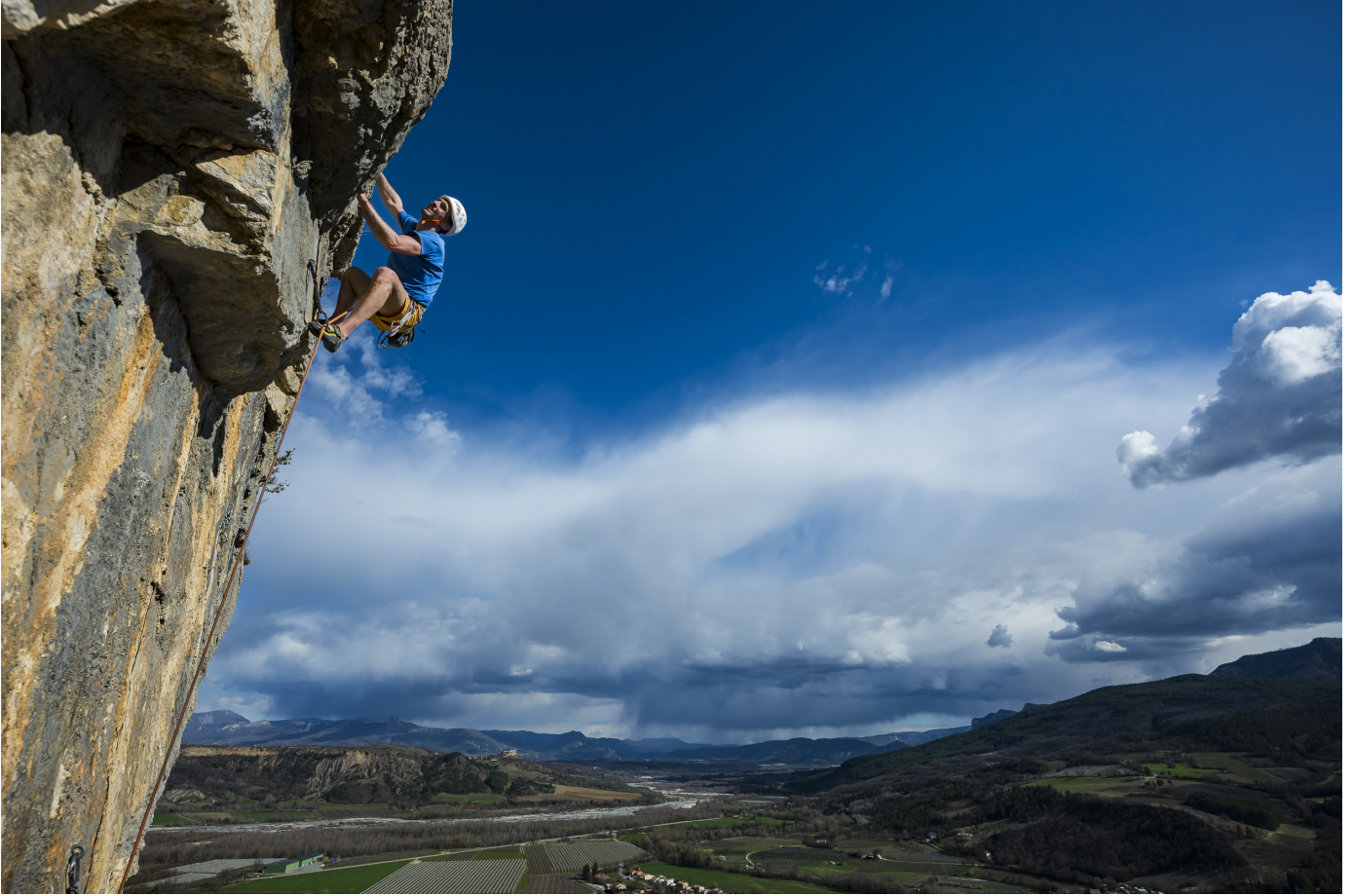
Baume Rousse site

Facing south at an elevation of 600 meters, the Baume Rousse cliff is the warmest in the Buëch region and therefore very pleasant in winter. Avoid visiting during the day in summer. The climbing here is very varied, with routes to suit all skill levels.