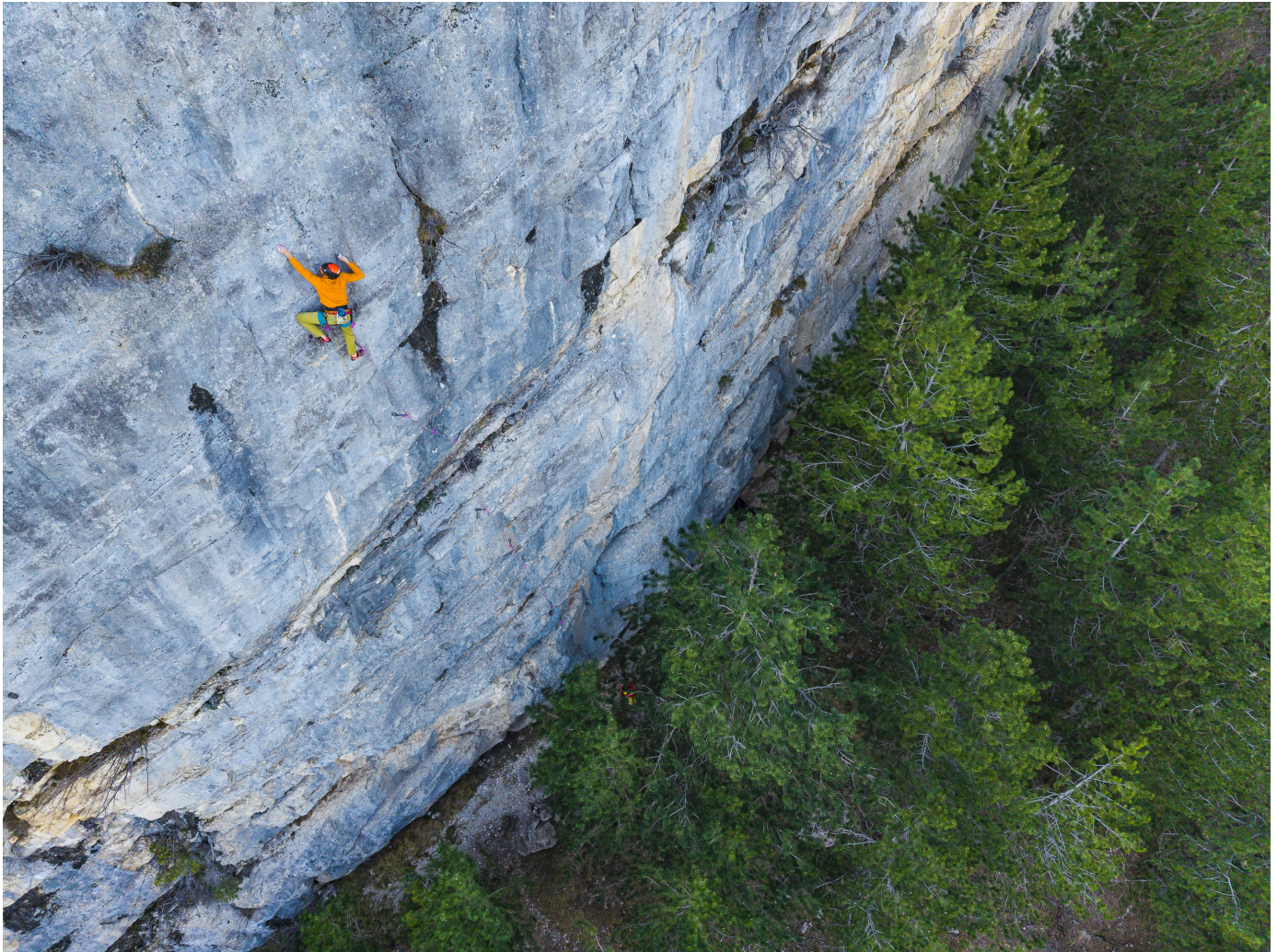
Site de Taillefer

Managed by the Sisteronais-Buëch Community of Municipalities since 2023, the area offers 14 routes up to 35 meters long. Grades range from 6a (a single route) to 7b, including 4 two-pitch routes.