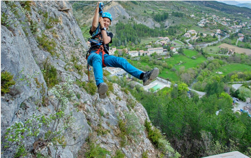
Via ferrata de Paturle (Gaetan Doligez)