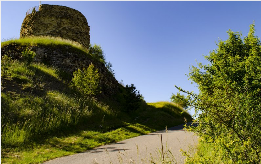
Montée à la tour (CCSB)